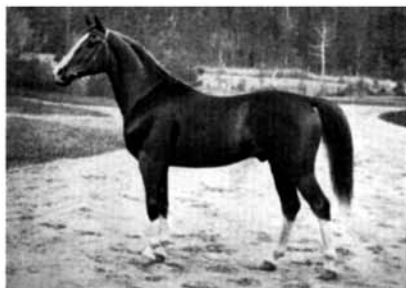
Bred in New Hampshire, Ribal stood at stud in Indiana before ending his career at Long Meadow Ranch in Arizona.