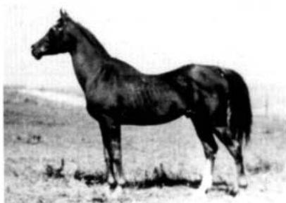
Ghadaf (1929-1957) in old age, whose dam and paternal granddam are also tail male to Zobeyni.